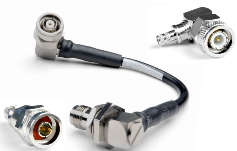
Photos shown: Left: Type N Straight Plug (Male), Center: TNC Right Angle Bulkhead Jack (Female) to RP-TNC Right Angle Plug (Male), Right: TNC Right Angle Jack (Female) on cable assembly