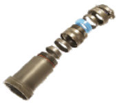
Band Lock Adapter