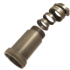
Shrink Boot Adapter