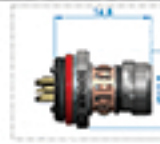
Extension 16,8 mm length