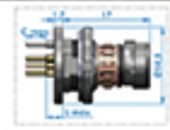
Receptacle 17 mm length