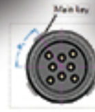
Receptacle - Extension Front view