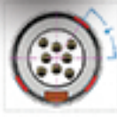
Plug Front view