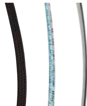
Two layers of 3M™ Twin Axial Cable SL8800 Series used in a 3M™ High Routability Internal miniSAS Cable (right) next to tight wrapped eight pair cable (middle), and to overbraided loose eight pair cable (left).