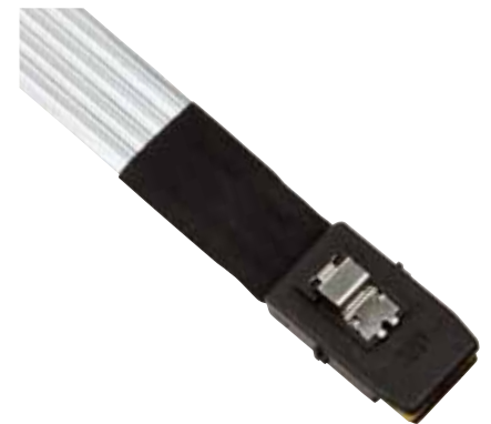
3M™ High Routability Internal miniSAS Cable Assembly using 3M™ Twin Axial Cable SL8800 Series low profile cable.

3M has tested these assemblies in folded configurations, and each fold impacts the impedance at that location by approximately only 1 ohm, well within the tightest impedance specifications (and note that the impedance at each fold is not cumulative, but is only a variation at that point). Similarly, S-parameter performance metrics are not degraded, and the cable assemblies still pass SAS 2.1 criteria, even with multiple folds. Should your design require any folding, be sure to restrain the cable with the appropriate cable clamps to prevent repeated flexure at the folds.